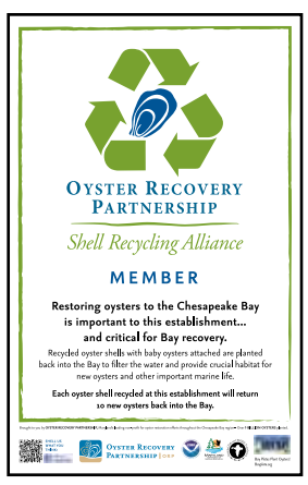
Decals and Hostess Signs